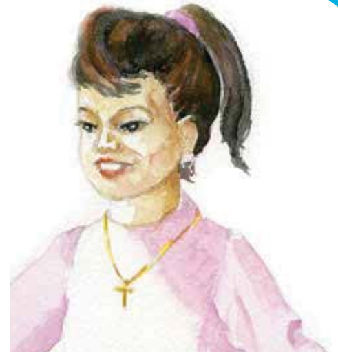
IMAGE ABILITIES GOD WISE WONDERED EYES PURPOSE PRESERVES MEMBERS SOUL BELIEVE FATHER

Circle these words in the puzzle. Then take turns using each word in a sentence.